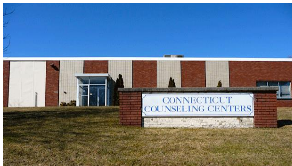
60 Beaver Brook Road, Danbury