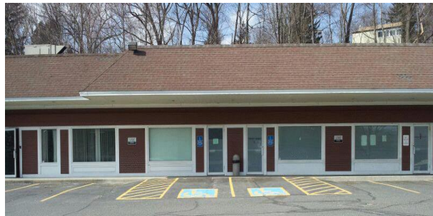
4 Midland Road, Waterbury