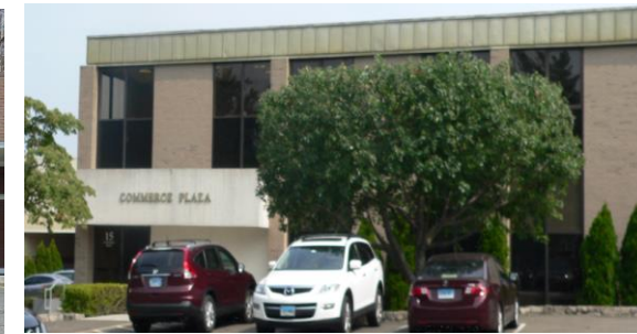
15 Commerce Drive, Stamford