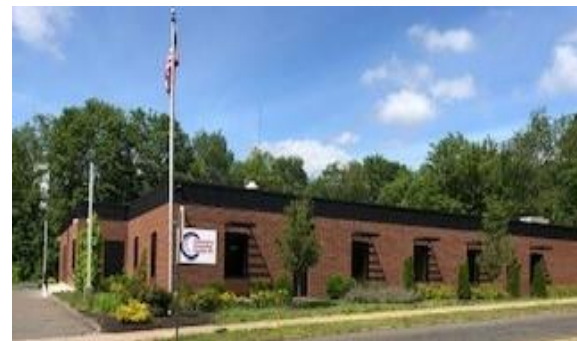
285 Kensington Ave., Meriden