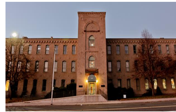
290 Pratt Street, Meriden